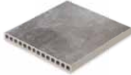
format 0140 terrace slab 35 40 x 40 x 3,5 cm calibrated