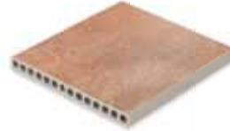
format 0140 terrace slab 35 40 x 40 x 3,5 cm calibrated