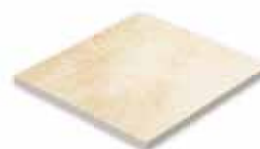
format 0143 terrace slab 20 40 x 40 x 2 cm calibrated