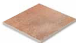
format 0143 terrace slab 20 40 x 40 x 2 cm calibrated