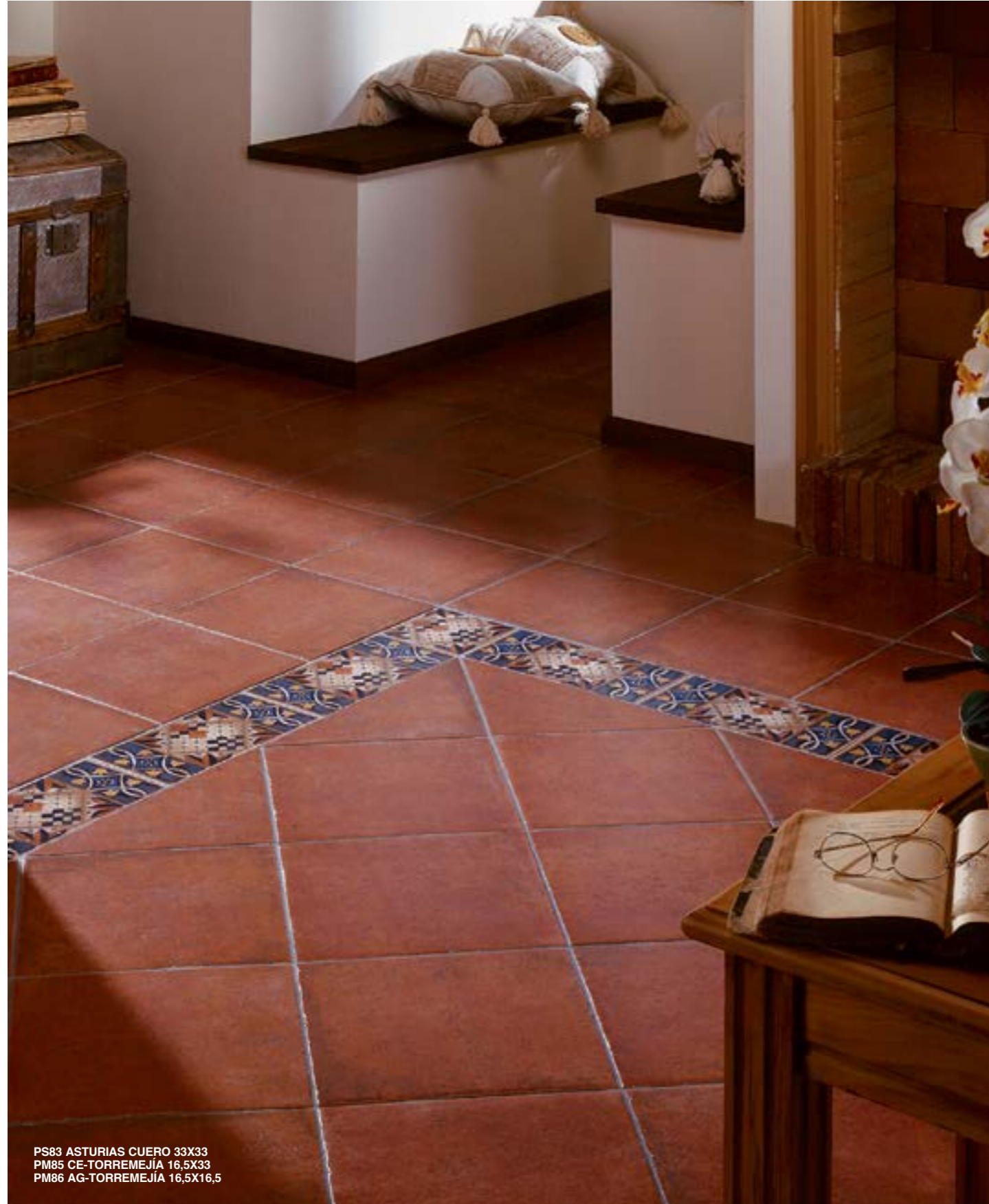
PS83 ASTURIAS CUERO 33X33 PM85 CE-TORREMEJÍA 16,5X33 PM86 AG-TORREMEJÍA 16,5X16,5