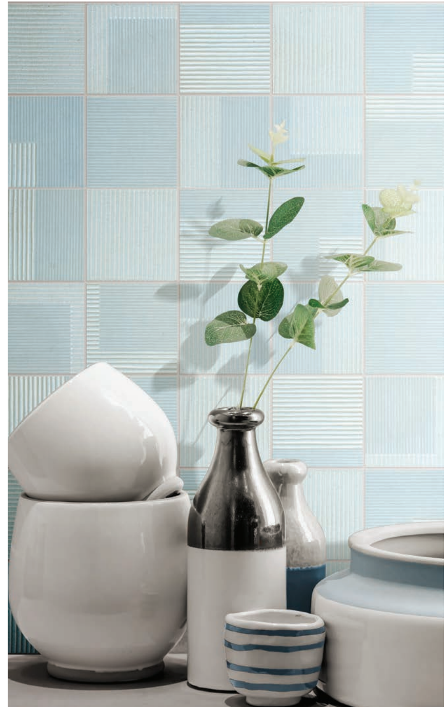
Labyrinth Light blue 29x29 cm / 11,6"x11,6"