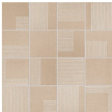
Labyrinth Beige 29x29 cm / 11,6"x11,6"