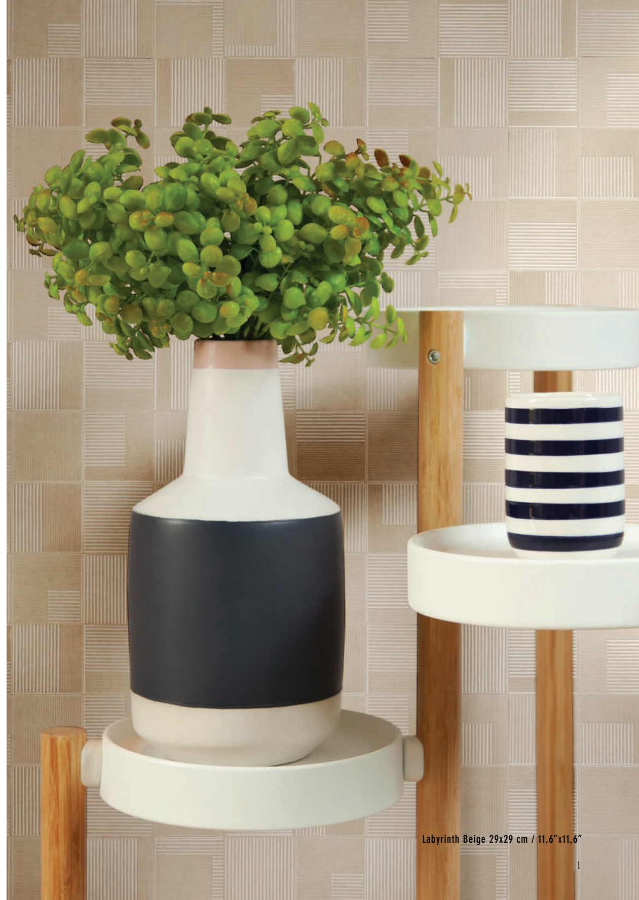
Labyrinth Beige 29x29 cm / 11,6"x11,6"

Labyrinth's features a simple design, material structure and endless geometric patterns. Randomly laid it creates a path, that you can follow with your fantasy, just as a maze game. It is available in 4 neutral shades that are perfectly matched with the material structure: this collection is suitable for all areas, creating a timeless design.