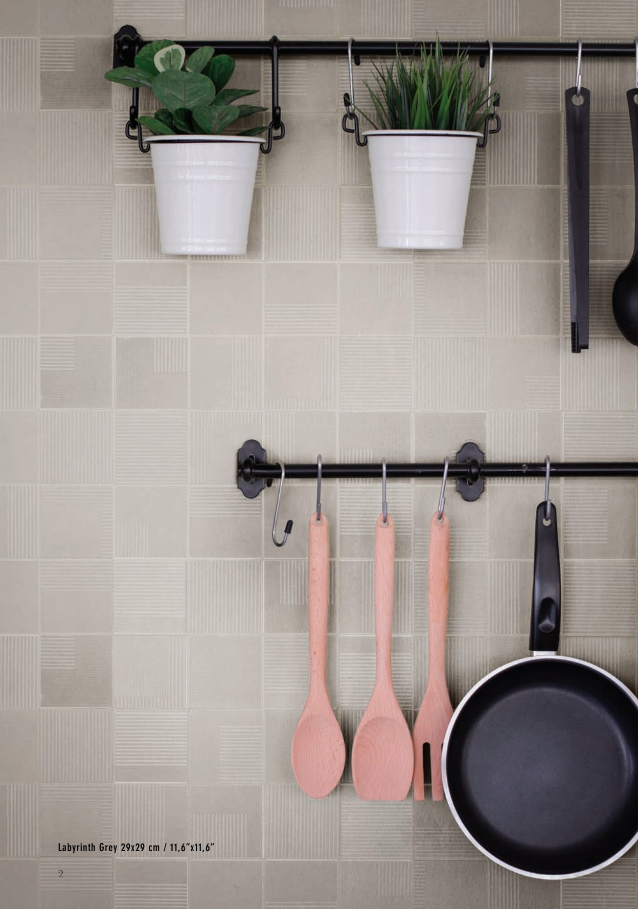
Labyrinth Grey 29x29 cm / 11,6"x11,6"