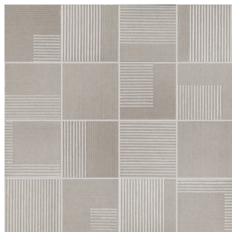
Labyrinth Grey 29x29 cm / 11,6"x11,6"