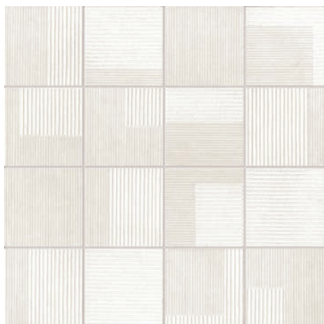
Labyrinth White 29x29 cm / 11,6"x11,6"